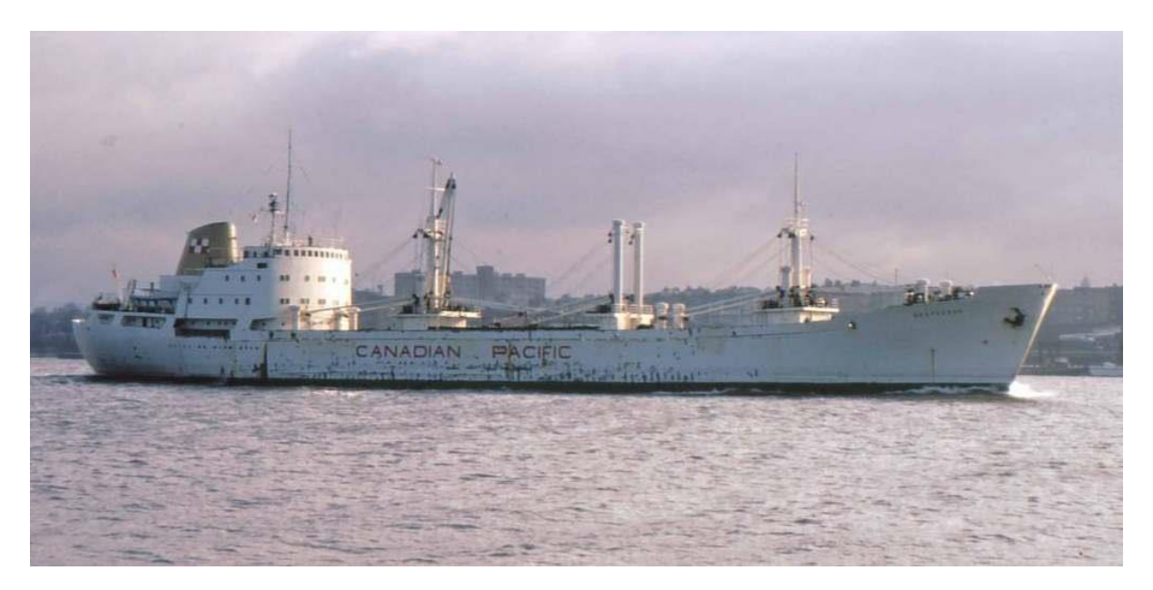
The vessel "Beaverash" made two journeys to Canada with Commando 'R' types.

The lowest numbered 'R' type was 129928. However this was not shipped until late March 1969. It is apparent from the records that a lower or higher frame/engine number is not a good indicator of age. i.e. bikes were not built or shipped in number sequence.