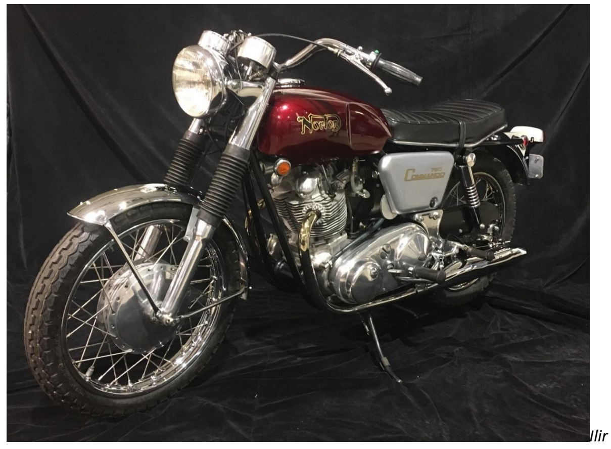
Ohri's superbly restored 'R' type is numbered 129928. It was shipped in April 1969 to S & G Firth, Toronto.