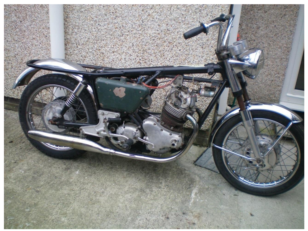
130373 (above) was shipped to Edmonton in January 1969 and 130201 (below) went to Winnipeg in February 1969. Both returned to England in 2016.