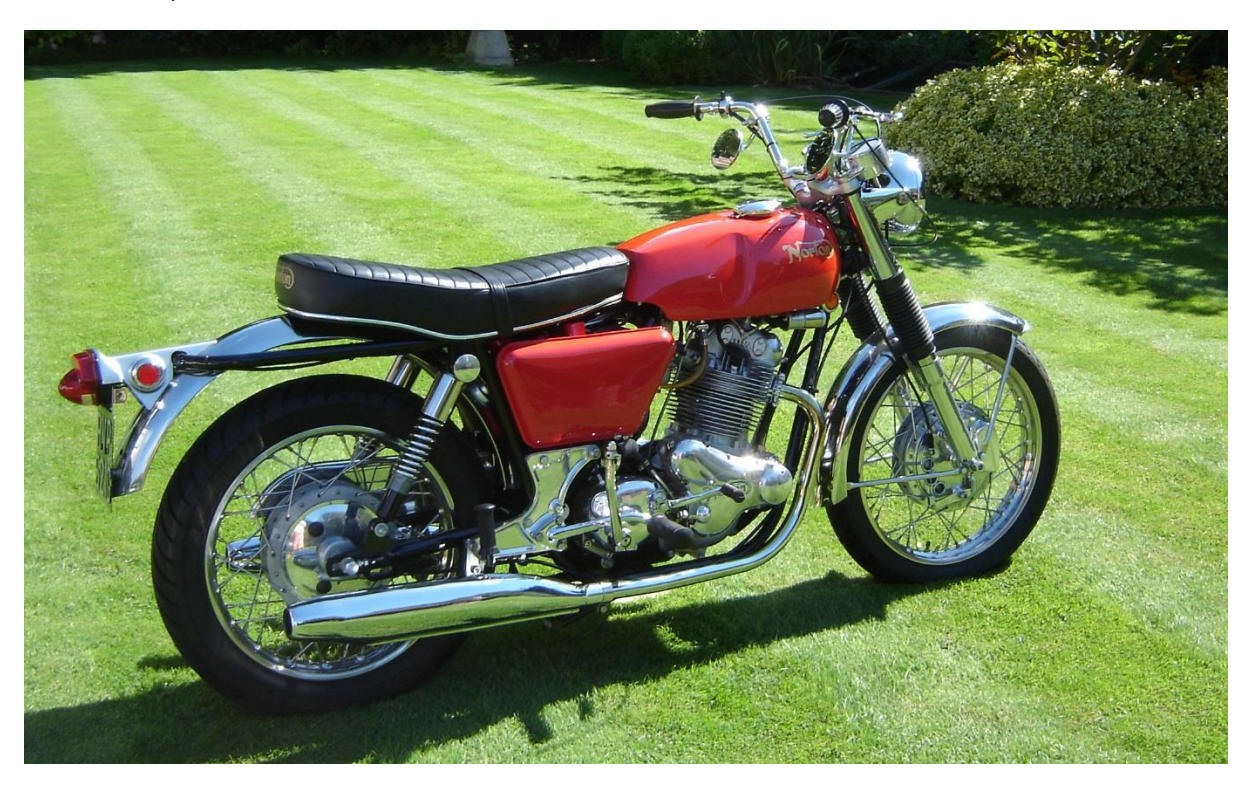
Gerry Lavender bought 130811 unseen and was expecting an 'S' type. He convert it back to an 'R' type with a deviation to the later timing cover.